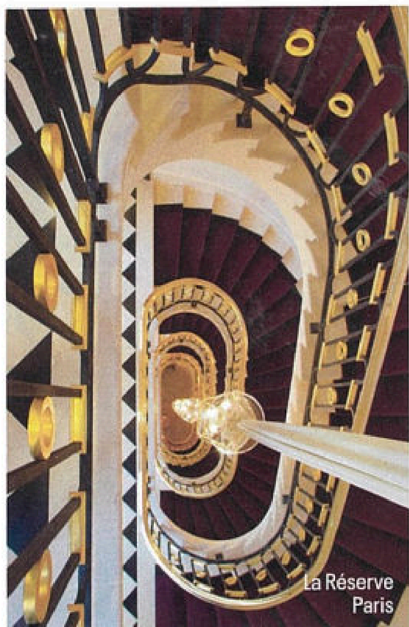
La Réserve Paris