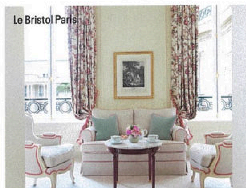
Le Bristol Paris