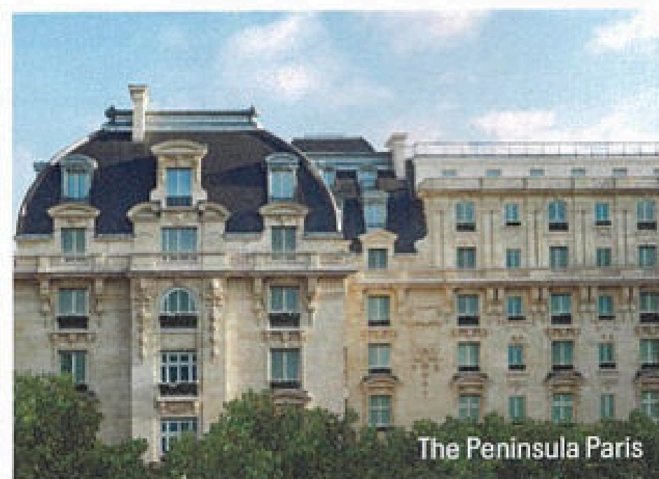
The Peninsula Paris